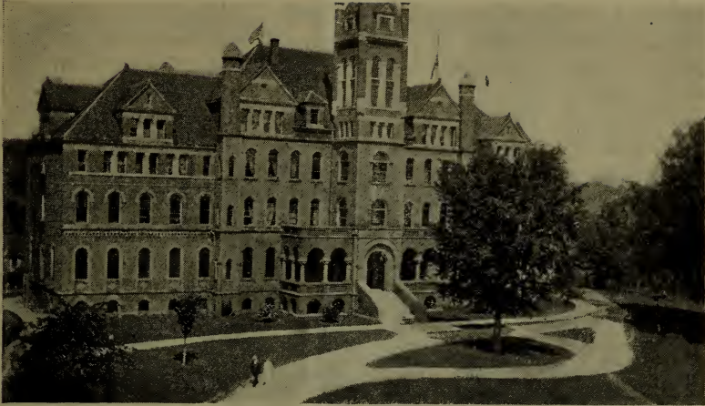
Main Building, Luther College.